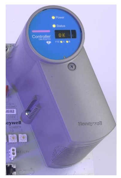
The 'designed-vertical' C300 Controller provides a superior control execution and scheduling environment.

The Experion C300 controller forms the heart of the Experion control system and deterministically executes control strategies, batch operations, interfaces to various types of I/O and directly hosts custom programmable applications. All of this is achieved using Honeywell's field-proven Control Execution Environment (CEE) for superior control execution and scheduling. Control strategies are configured and loaded through the Control Builder application, which provides easy and intuitive access to the controller configuration options.